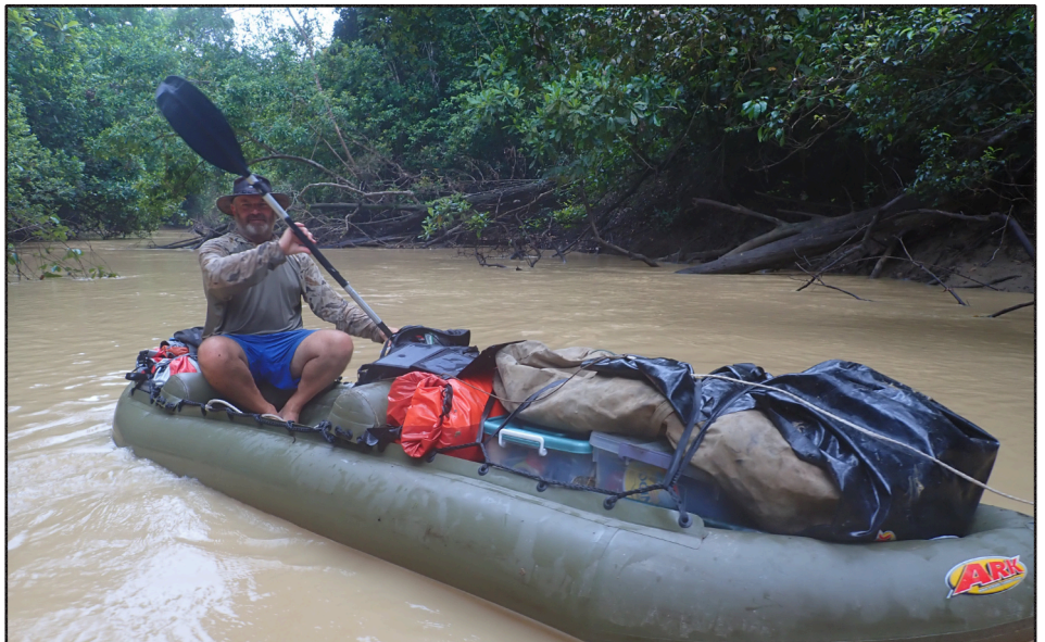
Not sure that canoe meets the loading regulations. Below, those trees could do with a bit of work

Late each afternoon we looked for a flat bit of ground in the jungle that wasn't too wet